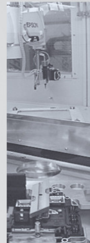
Special Machine Engineering